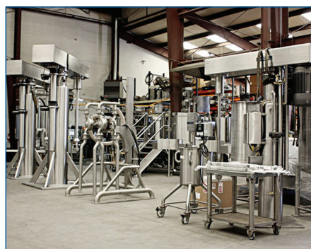
Serving Sanitary and Pharmaceutical