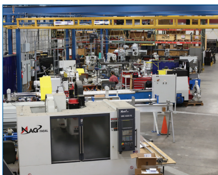
Serving Chemical and Industrial