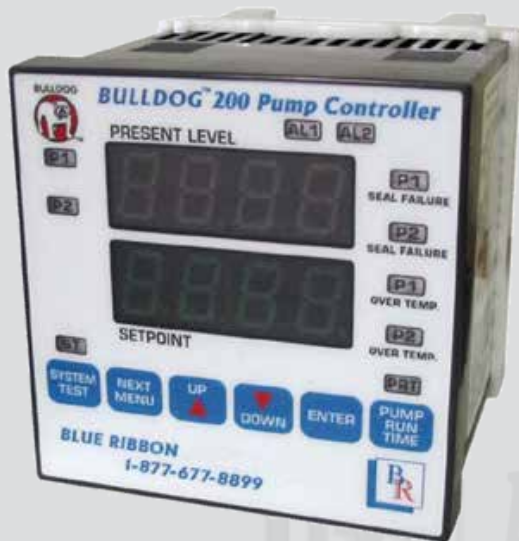
Model BD200 Dual Set Point Pump Controller

The Bulldog Model BD200 versatile, simple, and inexpensive, making it the ideal instrument for controlling dual pump lifting stations. Setpoints for ON/OFF and HI/LO alarms are easily set on the front panel. These same buttons also Enable/Disable pump alternation. A selectable time delay of up to 60 seconds on power-up for pump two prevents both pumps from starting at the same time and a large current draw. Alarms for pump seal failure and motor windings overheating are indicated by lights on the front panel. The dial can also display a runtime clock for each pump. An isolated 4-20 mA retransmission is standard. The front face is rated NEMA-4X for outdoor panel mounting. The BD-200 is also available with RS-232 or RS-485 protocol for connectivity with SCADA systems.