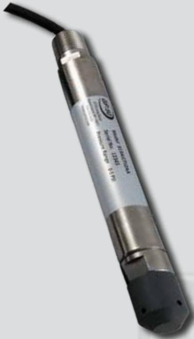
Model 313AI Submersible Level Transmitter for Hazardous Locations