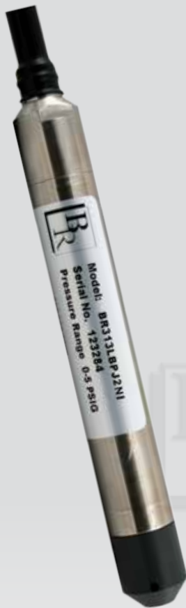
Model BR313L-NI Titanium Submersible Level Transmitter