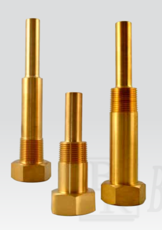
Model BR9TW Industrial Threaded Thermowells