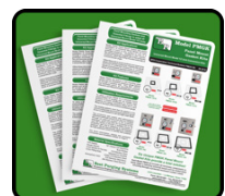
Model PMGK Panel Mount Gasket Kits Converts universal mount units for panel mounting in protected enclosures

One (1) Model EPWN Enclosure Warning Nameplate & One (1) Unit Flange or Panel Mount Fastener Kit furnished with all Units. All specifications subject to change without notice. Warranty & Liability policies available upon request.