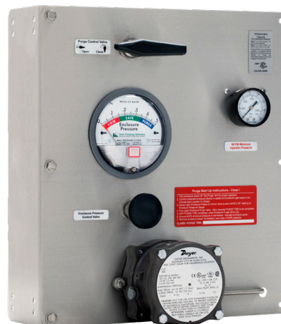
Vertical Mount Unit with Pressure Switch for left or right side mounting