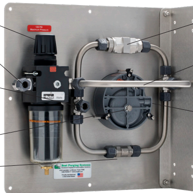
Universal Mount Unit less Pressure Switch

Filter Regulator Unit Supply Connection Enclosure Supply Connection Atmospheric Reference Enclosure Pressure Control Valve