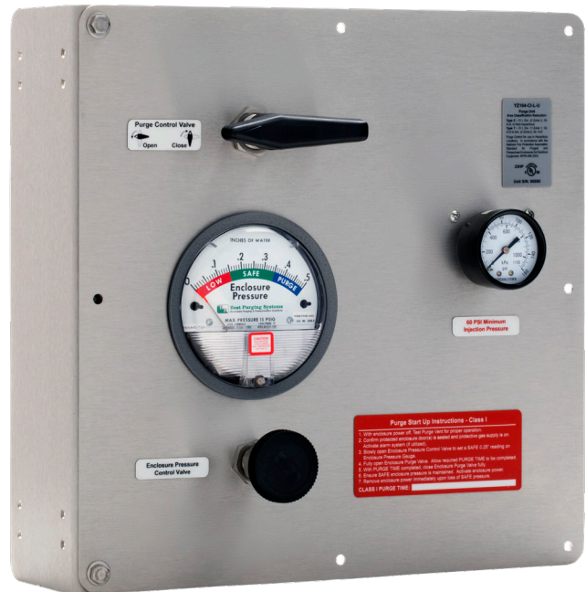
Universal Mount Unit less Pressure Switch for any side or panel mounting