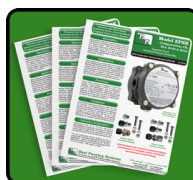
Model EPSK Enclosure Pressure Switch Kits Complements universal mount units to activate audible or visual alarms