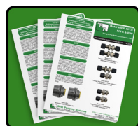
Model BCK Unit & Bulkhead Connection Kits Connects the unit and multiple protected enclosures of an array