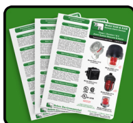
Model RAB & RAH Remote Alarm Beacons & Horns Signals loss of protected enclosure safe pressure