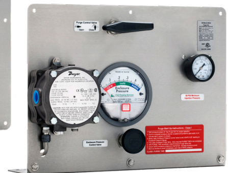
Horizontal Mount Unit with Pressure Switch for top or bottom side mounting