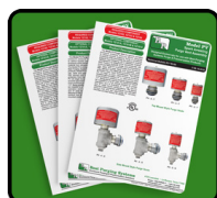
Model PV Spark Arresting Pressure Vents Prevents excessive enclosure pressure upon unit regulator failure