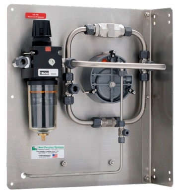
Vertical Mount Unit with Pressure Switch

Purge Control Valve Enclosure Pressure Reference Connection Enclosure Pressure Gauge