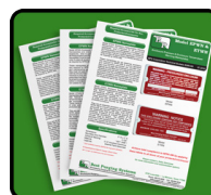
Model EPWN & ETWN Pressure & Temperature Warning Nameplates Provides NFPA required markings for protected enclosure doors and covers