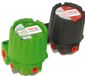
Thermo Scientific™ STD5000 and STD6000

When the installation area is limited, the compact size of the transducer enables it to be situated on the valve as needed, including at an angle or upside down, with no effect on functionality. In addition, the rugged NEMA 4X housing ensures durability and long life for maximum return on investment.