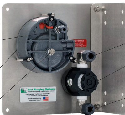
Universal Mount Unit less Pressure Switch

Enclosure Pressure Reference Connection Enclosure Pressure Gauge Atmospheric Reference