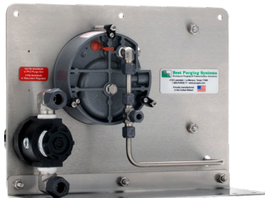
Horizontal Mount Unit with Pressure Switch

Enclosure Pressure Reference Connection Enclosure Pressure Gauge Atmospheric Reference