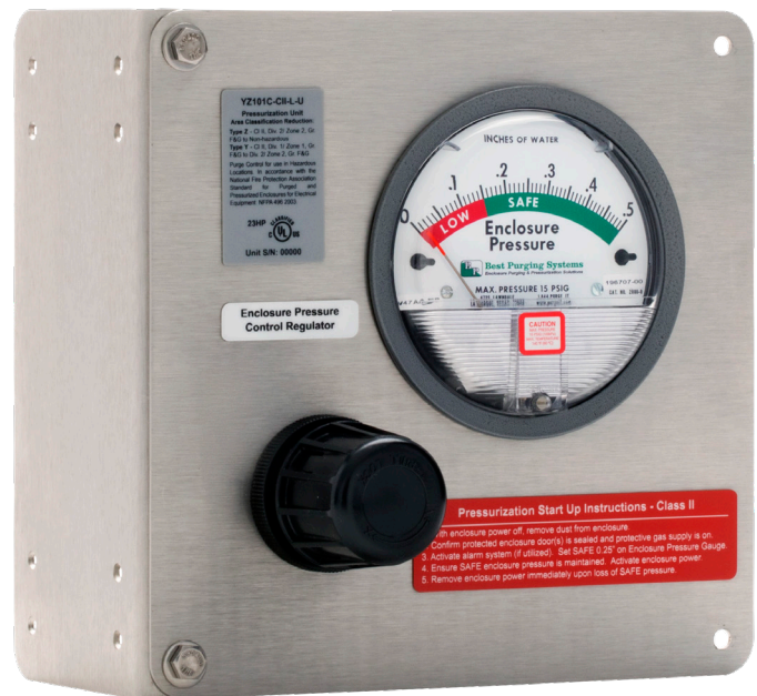
Universal Mount Unit less Pressure Switch for any side or panel mounting