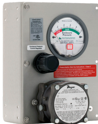
Vertical Mount Unit with Pressure Switch for left or right side mounting