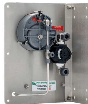
Vertical Mount Unit with Pressure Switch

Unit Supply Connection Enclosure Pressure Control Regulator Enclosure Supply Connection