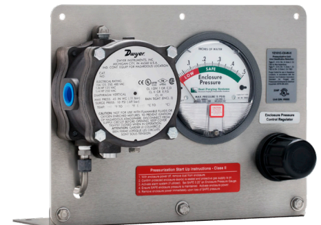
Horizontal Mount Unit with Pressure Switch for top or bottom side mounting