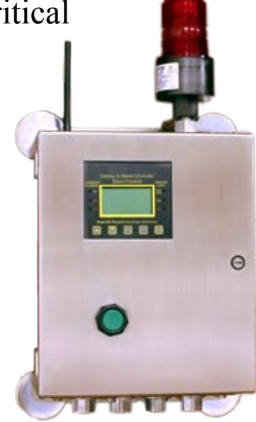
Available in NEMA 4X non-metallic, painted or stainless steel and NEMA 7 explosion proof wall mount

1245 Butler Road League City, Texas 77573 409-927-2980 • 409-927-4180 (fax) www.gdscorp.com • info@gdscorp.com